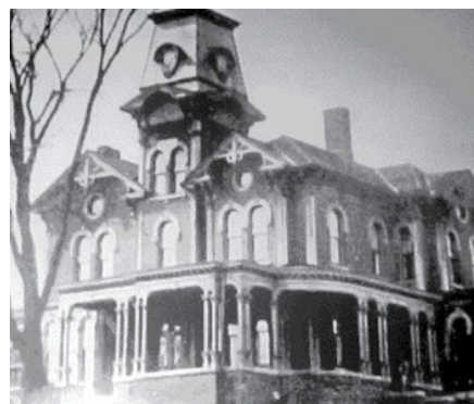
Hoyt Sherman Place, 1877